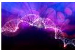
IAP Statement on 'Antimicrobial Resistance: A Call for Action' November 2013