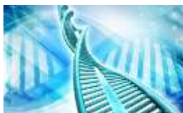
IAP Statement on 'Realising Global Potential in Synthetic Biology: Scientific Opportunities and Good Governance' May 2014

Statements – Short (2-3 page) documents that provide a synthesis the latest research findings on topical issues and provide advice and recommendations to policy-makers.