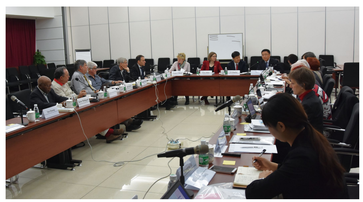
Discussion in progress.

"IAP launched the project to explore how national science academies could play a role in the process of achieving UN SDGs. This is a timely action by the Academies, since science – scientific thinking and