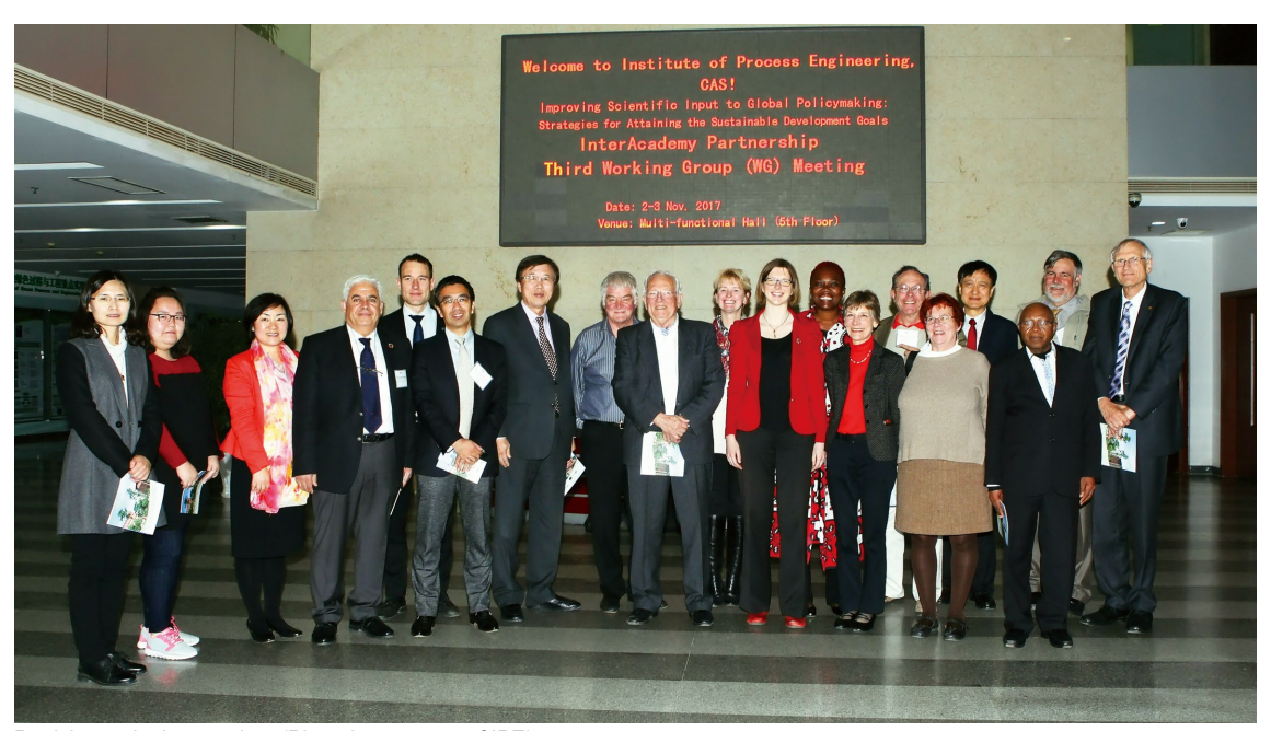
Participants in the meeting.

Cover of the guide to SDGs published by the IAP project "Improving Scientific Input to Global Policymaking: Strategies for Achieving the Sustainable Development Goals."