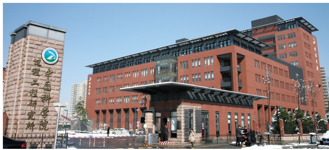
The "Process Tower," the main building of IPE.